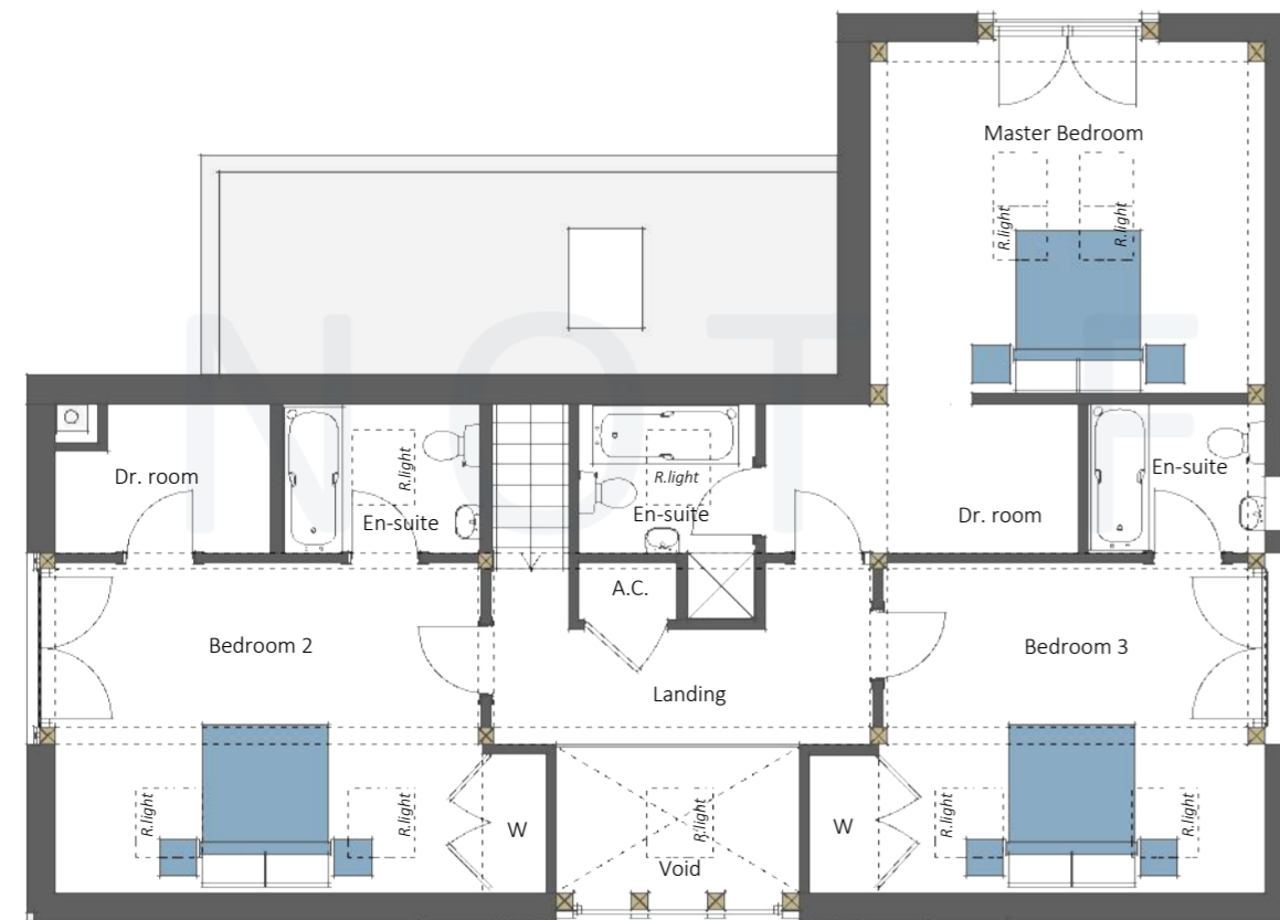
FIRST FLOOR GIA- 105 m 2