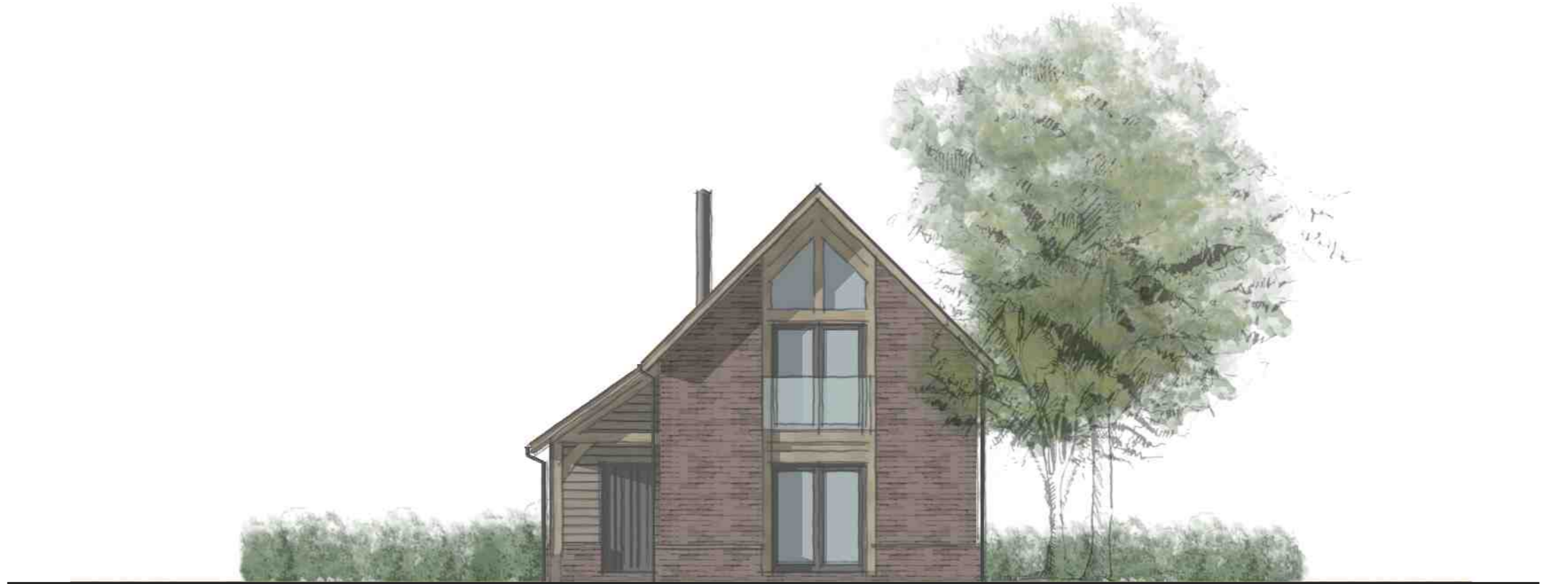
SIDE L ELEVATION