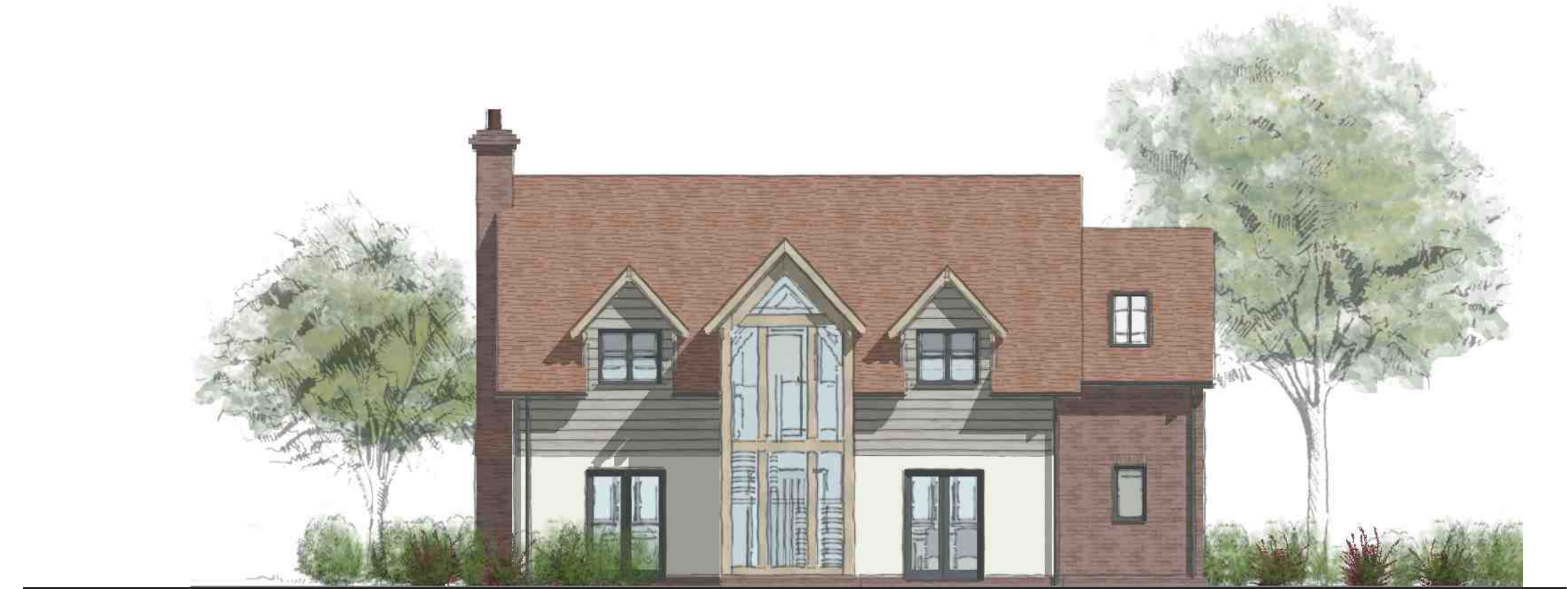
SIDE L ELEVATION